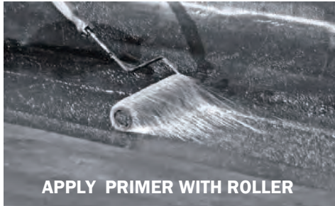
APPLY PRIMER WITH ROLLER

1. Using a four or nine inch roller, beginning on the high side (top of slope) of the roof, apply the Re-Flex Primer to the metal edge or walls, curbs, and vertical flashings. Extend the primer down the vertical surfaces onto and past any base flashing seam edge approximately 6 inches. Allow the primer to "flash-off" (dry).