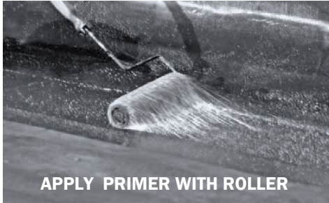
APPLY PRIMER WITH ROLLER

1. Using a four or nine inch roller, beginning on the high side (top of slope) of the roof, apply the Re-Flex Primer to the metal edge or walls, curbs, and vertical flashings. Extend the primer down the vertical surfaces onto and past any base flashing seam edge approximately 6 inches. Allow the primer to "flash-off" (dry).